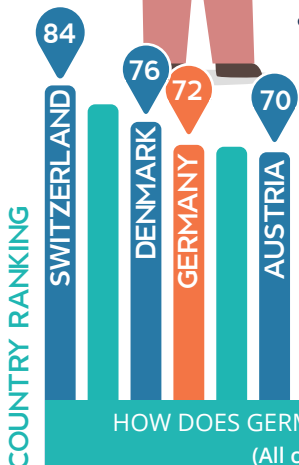
HOW DOES GERMANY SCORE COMPARED TO OTHER COUNTRIES? (All countries are evaluated on a 0-100 scale)