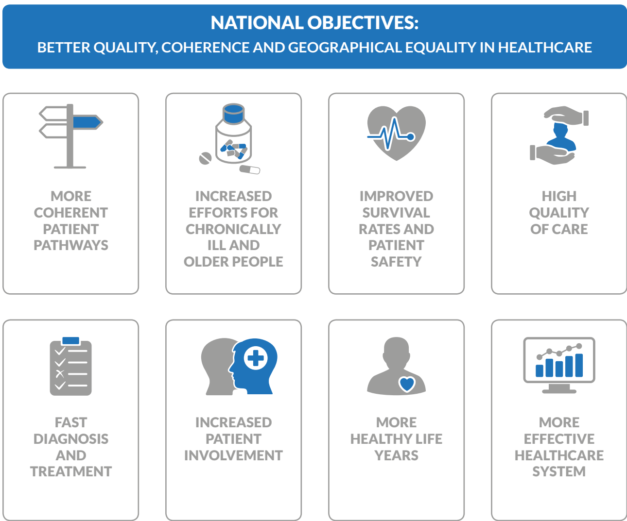
Figure 1. National objectives for healthcare 11